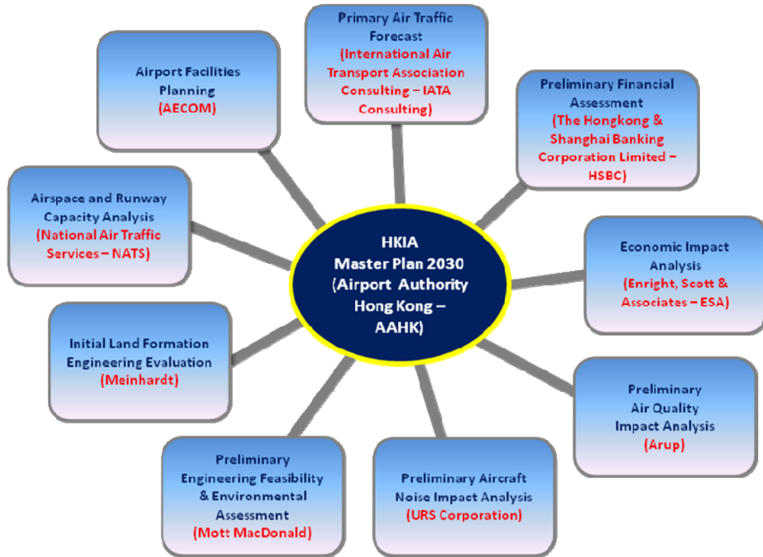
Figure 1.2 : Consultants Appointed for the Development of HKIA Master Plan 2030

nine independent consultants to research into different strategic aspects of airport development, which have been consolidated into the Master Plan 2030. Brief descriptions of these aspects are set out in Figure 1.2: